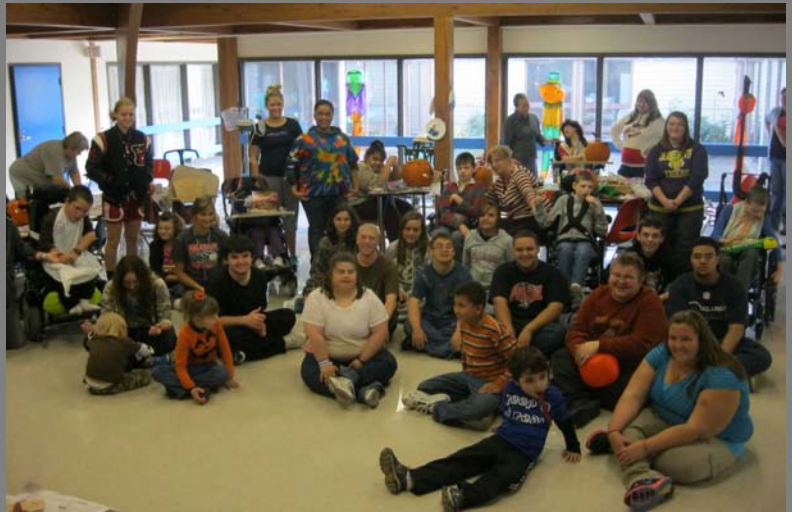
Above: Hannibal Career and Technical Center FBLA poses with the students of Mississippi Valley State School while painting pumpkins for Halloween.

Hannibal Career and Technical Center chapter of FBLA held their first service project on October 27, 2011. The chapter headed to Mississippi Valley State School to help the students paint pumpkins. We had an amazing experience and realized that to be a great leader you have to interact with everyone. The students at the local school also had an excellent time and appreciated our taking time out of our day to come celebrate Halloween with them by painting pumpkins. The students took their pumpkins home on Halloween day and displayed them for everyone to see!